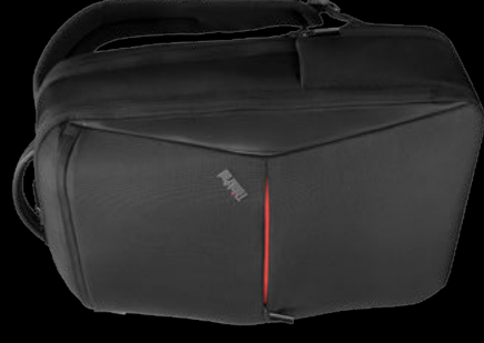
▶ ThinkPad ® Professional 15.6" Backpack