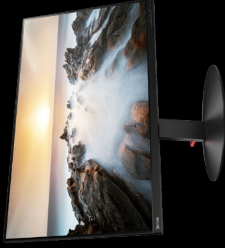
ThinkVision ® P32u ▶ Monitor