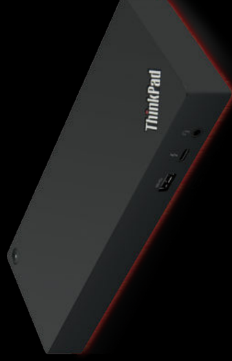
▶ ThinkPad ® Thunderbolt ™ Workstation Dock