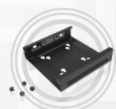
ThinkCentre Tiny VESA Mount II

1 TBR Large Enterprise Repair Rate Study 2011.