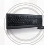
Lenovo Professional Wireless Keyboard & Mouse Combo