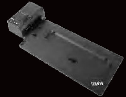
ThinkPad Pro Dock ▶