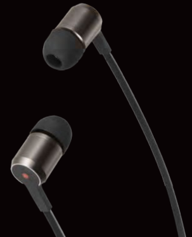
Lenovo In-ear ▶ Headphones