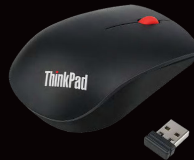
◀ ThinkPad Essential Wireless Mouse